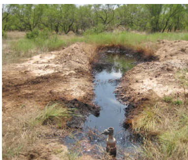
RRC capped this abandoned leaking well in Archer County earlier this year. In addition to plugging the well to stop the environmental threat, the released fluids were disposed of properly and the contaminated soil was remediated.