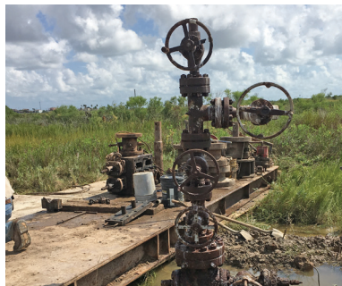
This 45 year old abandoned well was found to be leaking gas within inundated marsh land in Galveston County. RRC’s well plugging program is working to plug this well in September 2019.

In fact, RRC ended the FY 2018/19 biennium by plugging more wells than required by the General Appropriation Act’s performance measures. In FY 2018, the agency plugged 1,364 wells, 385 more than the budget target of 979. By August 31st, 2019, the end of FY 2019, RRC had plugged 1,710 abandoned wells for the fiscal year, exceeding the annual performance measure by 731.